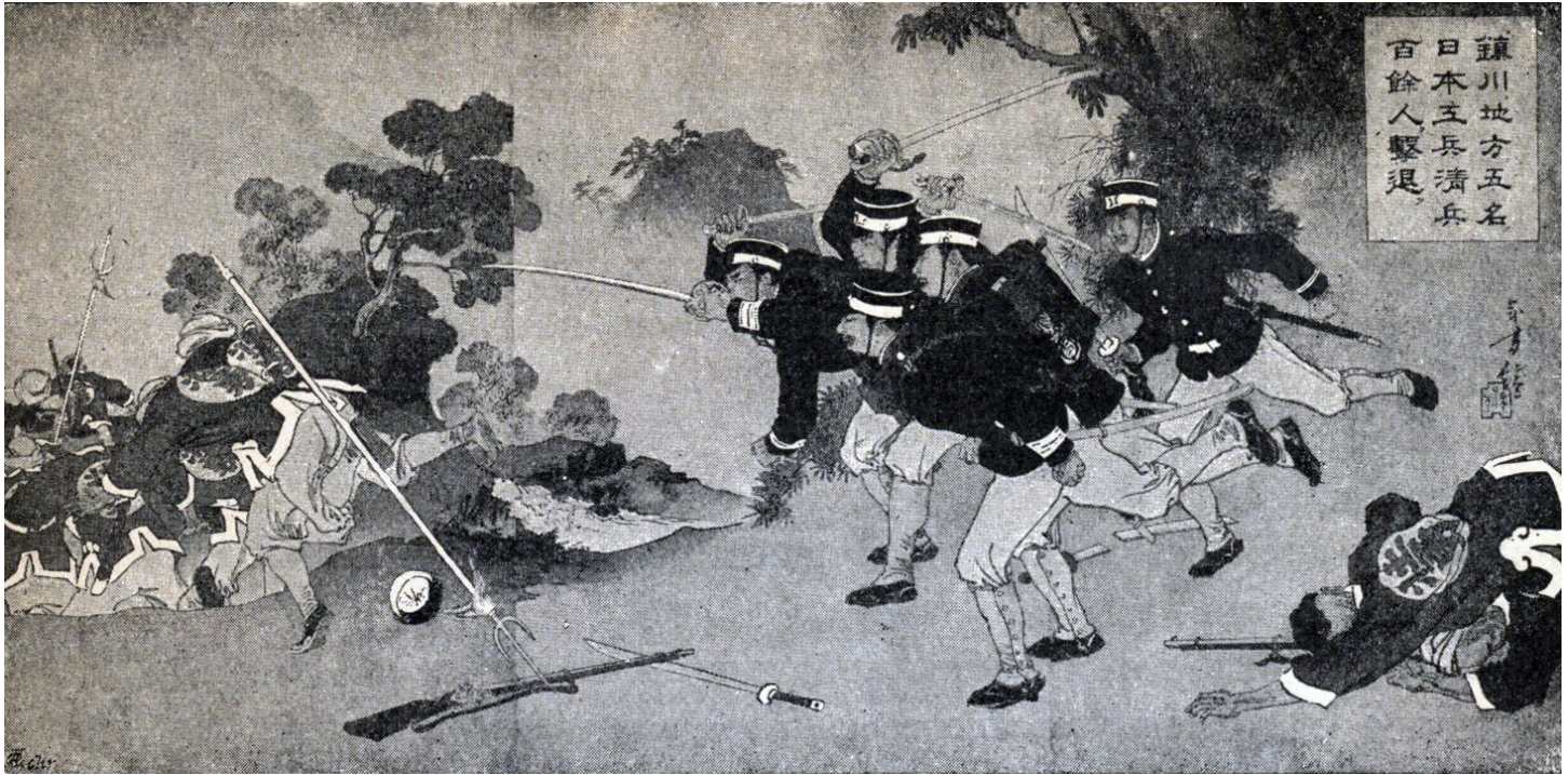
Woodblock print from 1894 showing Japanese soldiers in European-style uniforms (right) chasing retreating Chinese troops (left) during the Sino-Japanese War. Public domain.

Within two decades, Japanese victories showed the success of these military reforms. They set their eyes on expanding into Korea, which was under Chinese control. Japan's victory in the First Sino-Japanese war (1894-1895) forced China out of Korea.