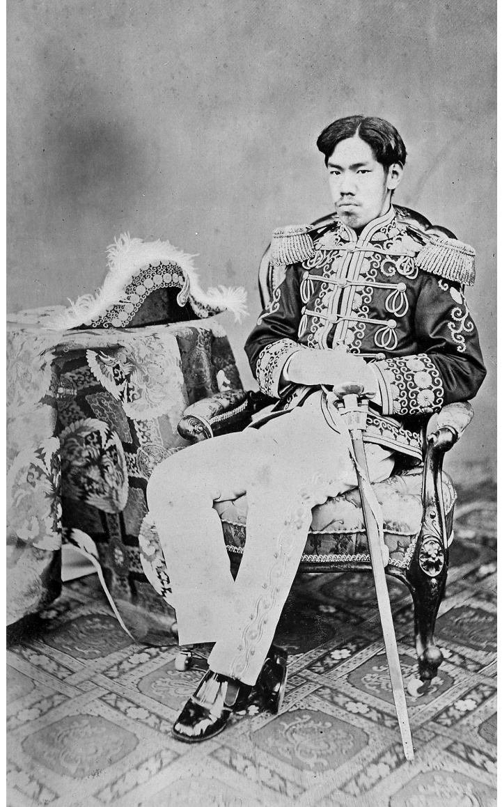
Photograph by Uchida Kuichi of the Emperor Meiji (1873) in his military outfit. Public domain.