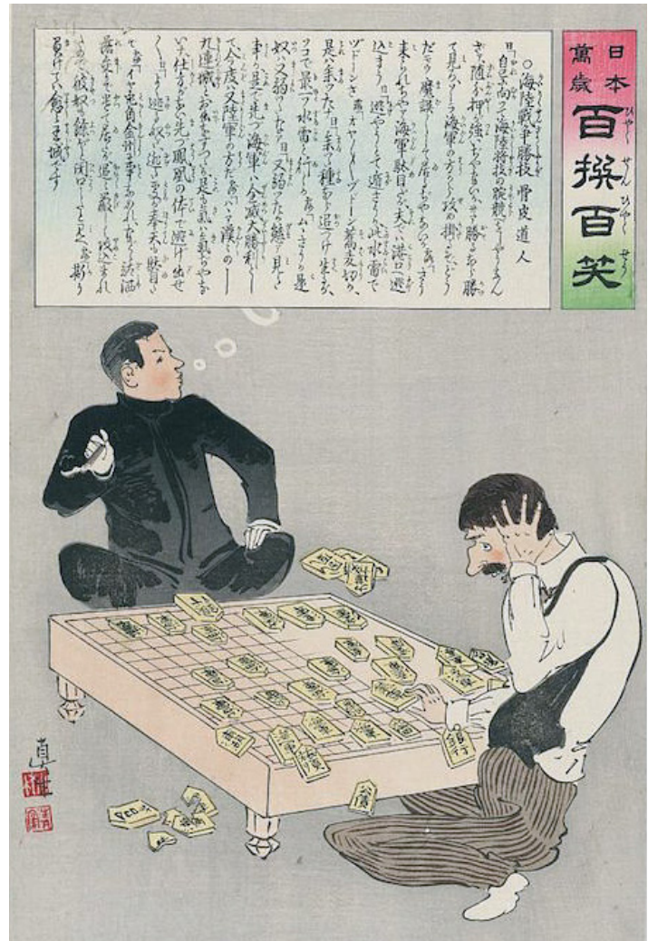
Political cartoon about the Russo-Japanese War. A confident Japanese man is shown beating a Russian opponent at the game of dai shogi. Public domain.

The Meiji Restoration transformed Japan. The government became centralized around the figure of the emperor. The political system now allowed people to pursue new opportunities. Japan also underwent rapid industrialization. That meant the Japanese people experienced social changes. Among them were better education and increased rights and opportunities. At the same time, it created new tensions as focus (and money) was concentrated on industrializing cities at the expense of rural farmers. Japan was so committed to keeping pace with Western developments, it quickly became recognized as a world power.