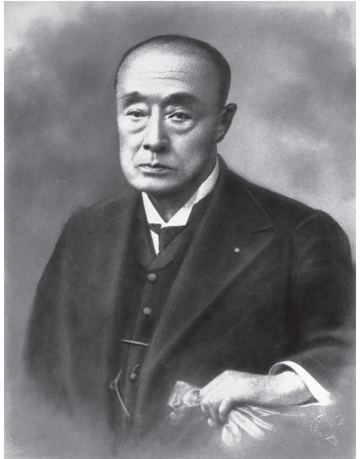
Monochrome photograph of Yoshinobu Tokugawa, the last shogun of Japan. Public domain.

The Tokugawa family took control of the shogunate around 1600, bringing some stable leadership after a period of unrest. The Tokugawa shogunate established strong control over local daimyo and enforced traditional Confucian policies. Peasants, who were around 80% of the population, could not work any job other than farming. The Tokugawa were also extremely suspicious of European influence. In 1636, the shogun announced the Act of Seclusion, which made it illegal for Western merchants to trade in Japan. Only the Dutch were granted a single trading post in Nagasaki. Japanese merchants could still trade in China and Korea. However, the Act of Seclusion effectively cut the Japanese off from Europeans.