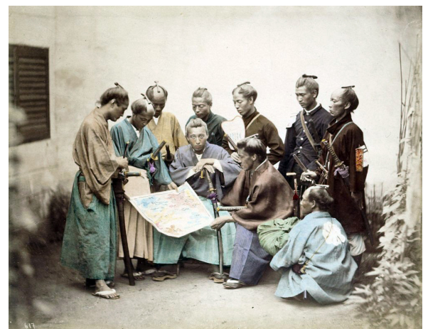
Samurai from the Choshu clan, who supported the emperor. Public domain.