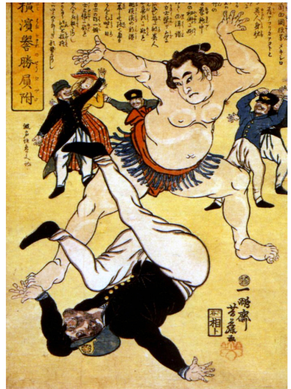
An 1861 image expressing the “jōi” or “Expel the Barbarians” part of slogan sonnō jōi. Public domain.

The Meiji Restoration made Japan a nation-state. During the era of the shogunate, each region had its own military, controlled by samurai loyal to their daimyo . Under the Meiji emperor, these regional armies were replaced by a national army. All male citizens were required to serve in the military. The new government welcomed new ideas and technologies brought to Japan by Western merchants and diplomats. By adopting industrialism—specifically factories—the Japanese military could now rival European armies.