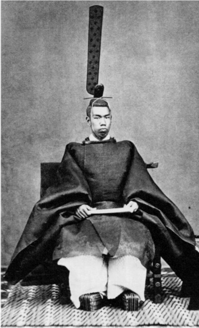
Photograph by Uchida Kuichi of the Emperor Meiji (1872) in his formal court outfit. Public domain.