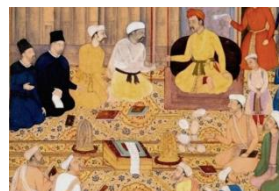
Tolerance of religious/ethnic minorities ( dhimmis ): *Devshirme System (Janissaries) *Millet System *Jizya *Divine Faith (Mughal: Akbar) *Wives/harem from different religions

Centralized states with an autocratic ruler and organized bureaucracy