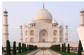
Monumental architecture/art to glorify and legitimize rule

Analyze the following images and review the accompanying brief descriptions/hints. List possible arguments you can make in response to the prompt in the box below.