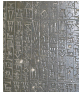
Detail of the stele carvings

Following the laws is an Epilogue in which Hammurabi states how the laws should be carried out.